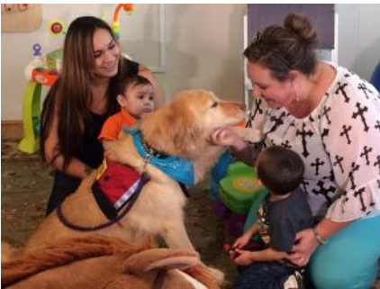
Emma, the service dog, with Chaves County CASA participants.