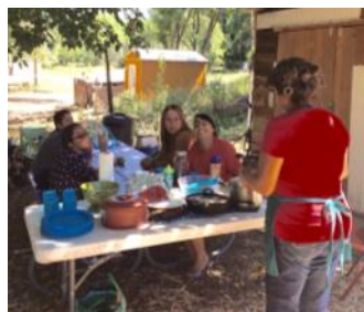
Northern Youth Project.