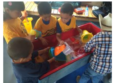
Canones Early Childhood Center.