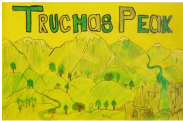
Araya Blue Cordova-Vigil, 10 years, 5th Grade, Truchas Summer Program